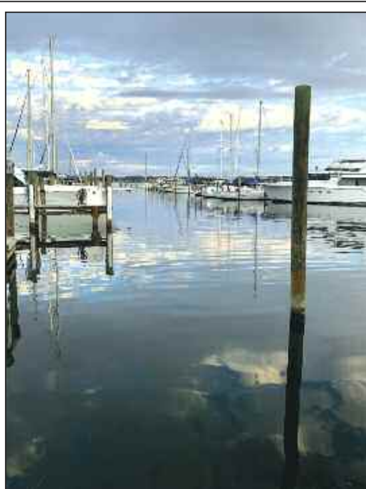
"Still waters at Bear Point reflect the sky," writes Courtney Gibb.