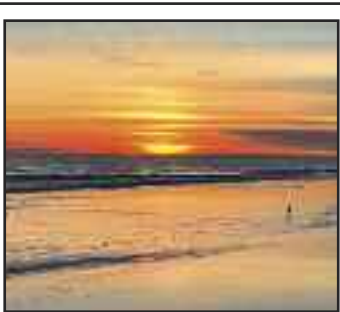
"Sunset on the beach in Gulf Shores," writes Cori Andrews from Mobile.